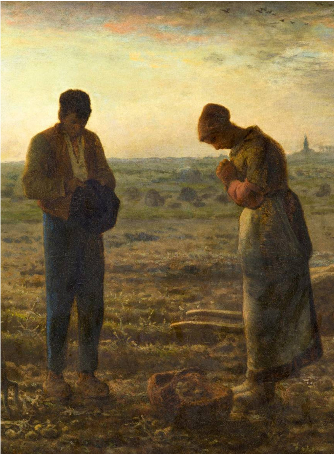
L'ANGÉLUS, JEAN-FRANÇOIS MILLET, MUSÉE D'ORSAY